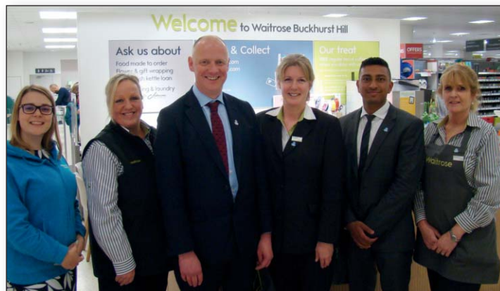
Participants from the Dementia Awareness session