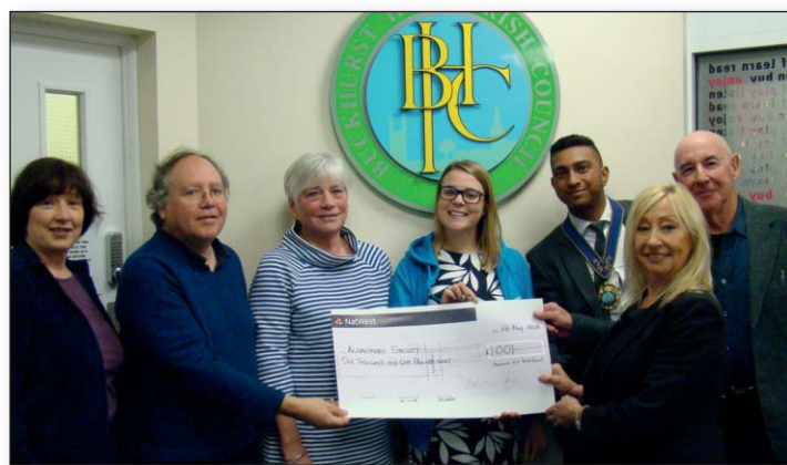
Presentation of Cheque to the Alzheimer's Society Fund Raiser with members of the Parish Council and Residents' Society,