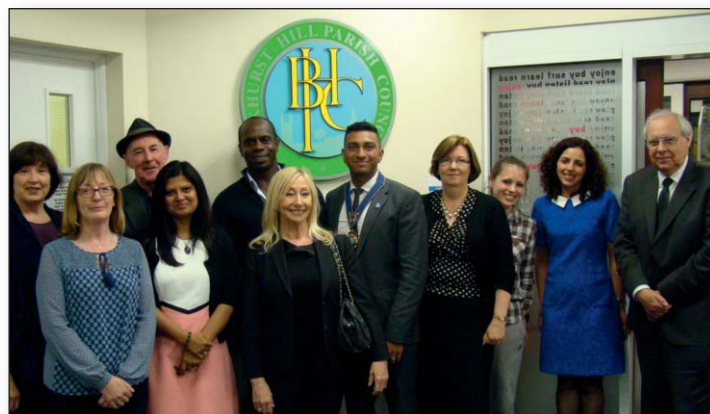
Parish Councillors with the Parish Clerk and his team